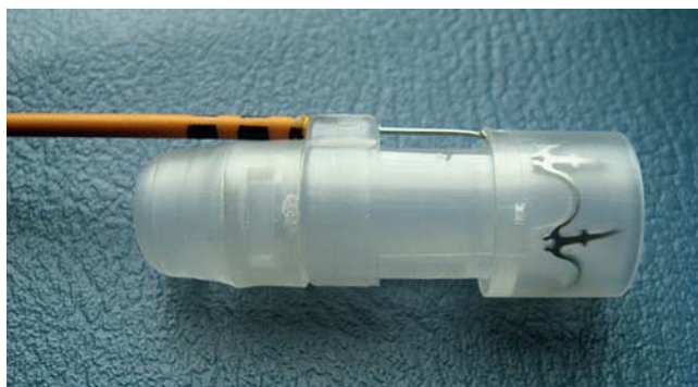
Fig. 5 Padlock-G clip loaded in a clear version of the Lock-It system.

†Stomach ruptured at site away from Padlock-G clip closure.