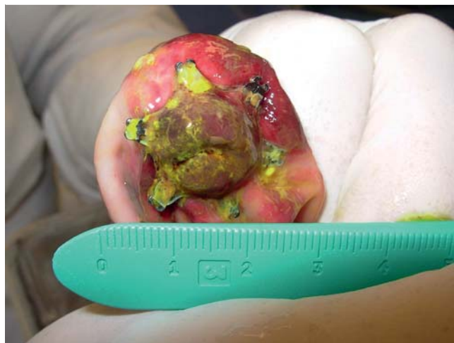
Fig. 4 Internal view (after excision) of a Padlock-G clip deployed in a non-survival in vivo porcine stomach.

One concern with the device is how to handle its inaccurate deployment. We have successfully utilized a snare to remove the Padlock-G with minimal mucosal trauma. If a gastrotomy was incompletely closed, a side-by-side application of a second Padlock-