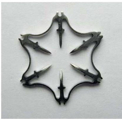
Fig. 1 Padlock-G clip.